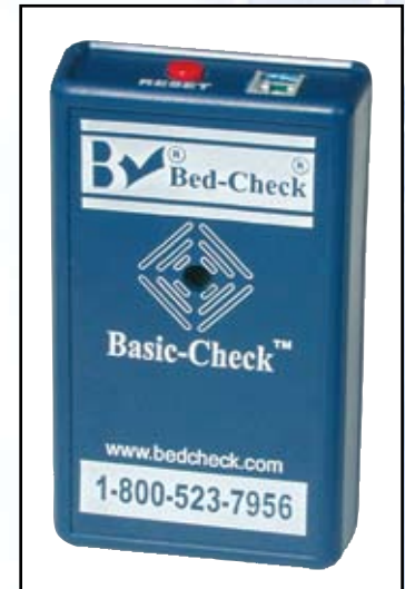
Basic-Check® Control Unit

Mounting choices – Integral hanger and Velcro® strip included.