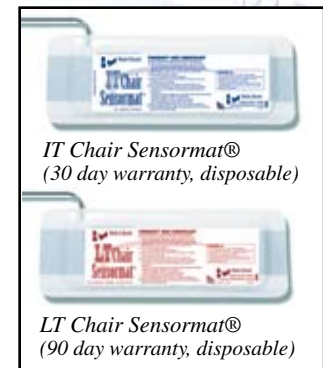
IT Chair Sensormat® (30 day warranty, disposable)